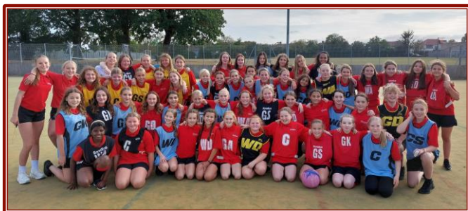
Year 7 and 8 Netballers

It has been great seeing so many girls at netball practice. They have been working hard to improve their skills including dodging and defending. We have been very grateful for the Year 9 girls support with coaching the Year 7 and 8 netballers. They have been brilliant showing confidence and sharing their knowledge. Next half term will be busy with league fixtures starting for all year groups. Keep an eye on the PE board for fixtures and team sheets.